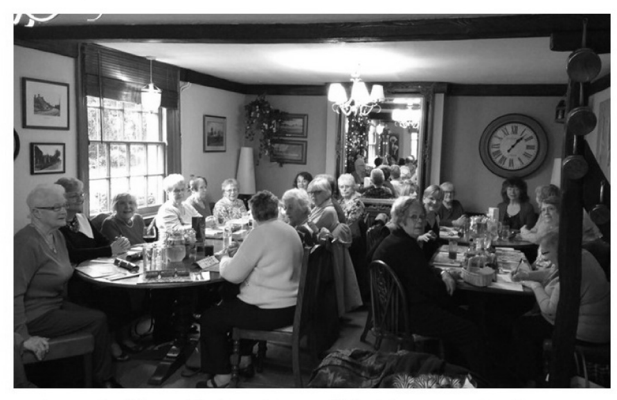
A wonderful world where the word Covid was as yet unknown

In the meantime, just to make sure we will all recognise each other when we next meet up, here is a photograph of our most enjoyable New Year lunch at the Hare and Hounds in January 2020.